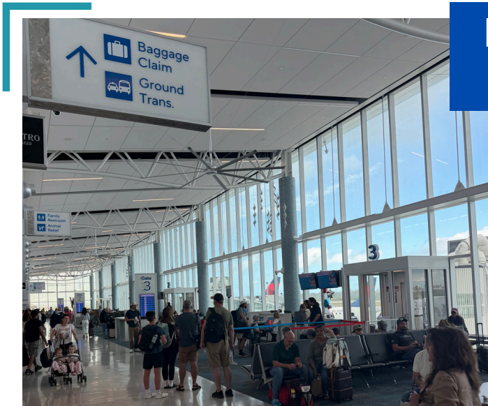
Passengers are pictured above in Concourse A on April 8, 2026. Nearly 500,000 passengers have used the airport so far this year.

Pictured above, passengers lounge in Concourse A prior to departure, March 24, 2026.